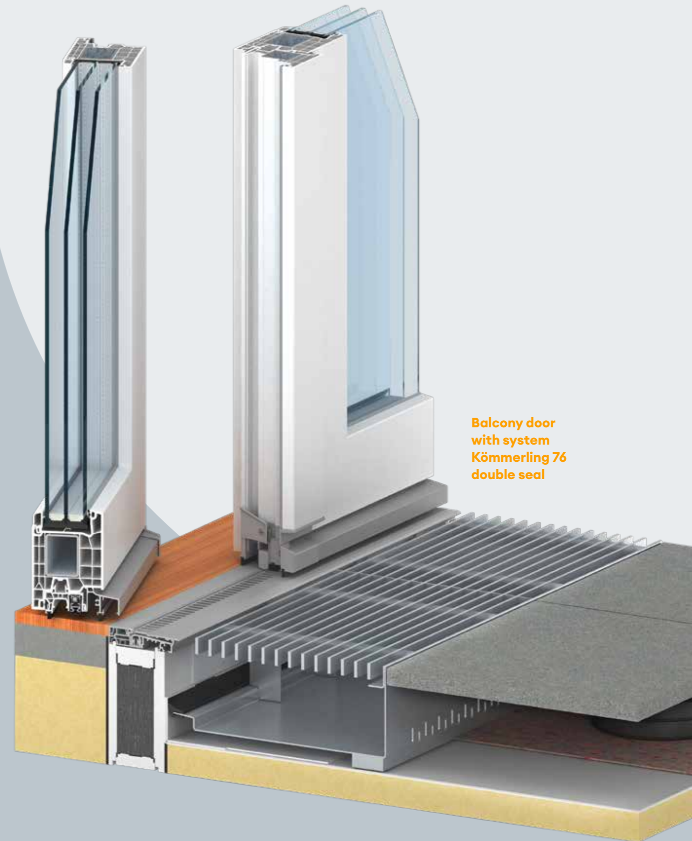
Balcony door with system Kömmerling 76 double seal